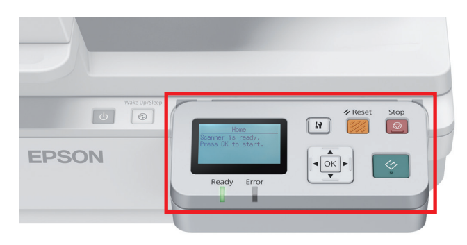
Easy navigation of job settings with LCD panel on network interface panel

With the optional network interface panel, scanners can be shared amongst a work group without the need for USB connections. Users can easily select a desired PC within the network via the Document Capture Pro application installed on a Client or Server PC.