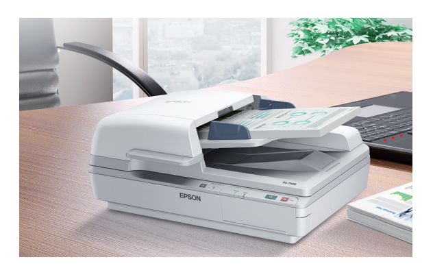
^{\star} Paper Document Size < A6 = 60-190gsm; All other sizes = 50-128gsm

High-capacity 100-sheet ADF readily accepts a wide variety of standard or thin paper documents. It is fitted with an ultrasonic sensor which prevents double-feeding and alerts users in the event of a mis-feed.