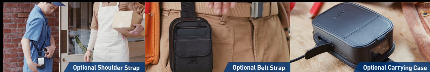
Optional Shoulder Strap