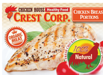
Food and beverage label