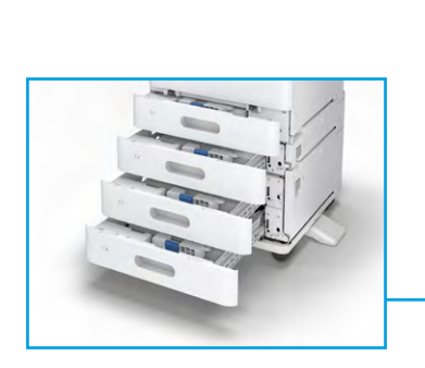
Expandable Paper Capacity Expand the paper handling capacity up to 2,100 sheets by adding additional trays.

The WorkForce Enterprise AM-C400/C550 models redefine office printing as Epson's first-ever A4 linehead inkjet models, boasting remarkable print speeds of 40ppm and 55ppm respectively. These compact printers are designed to deliver reliable, high-speed printing while occupying minimal space, making them perfect for office environments. They come equipped with user- and space-friendly features, including a hassle-free front-loading design, a transparent ink window, and a customisable layout, ensuring efficiency and convenience in every print task.