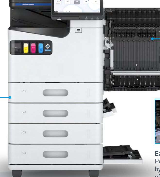
Easy Maintenance Perform maintenance easily by accessing just one side of the printer to remove jammed paper.