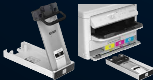
Designed for easy replacement of ink packs

In addition, Epson's DURABrite™ Ultra ink delivers laser-like quality prints that are water- and smudge-resistant.