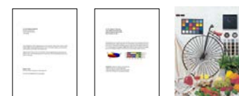
#1 Black Text | #2 Black Text and graphics | #3 Photo 4R (4 x 6")

†1 Print speed (Pages Per Minute) is calculated when printed on A4 plain paper in the fastest mode, 10 x 15 cm photo print speed when printed on Epson Premium Glossy Photo Paper. Print speed may vary depending on system configuration, print mode, document complexity, software, type of paper used and connectivity. Print speed does not include processing time on host computer.