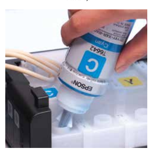
Smart tip design for easy, mess-free refills