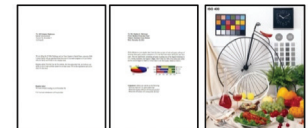
#1 Black Text #2 Colour #3 Photo 4R

*1 Print speed (Pages Per Minute) is calculated when printed on A4 plain paper in the fastest mode, 10 x 15 cm photo print speed when printed on Epson Premium Glossy Photo Paper. Print speed may vary depending on system configuration, print mode, document complexity, software, type of paper used and connectivity. Print speed does not include processing time on host computer.