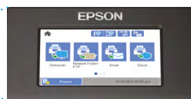
4.3" Touch panel LCD