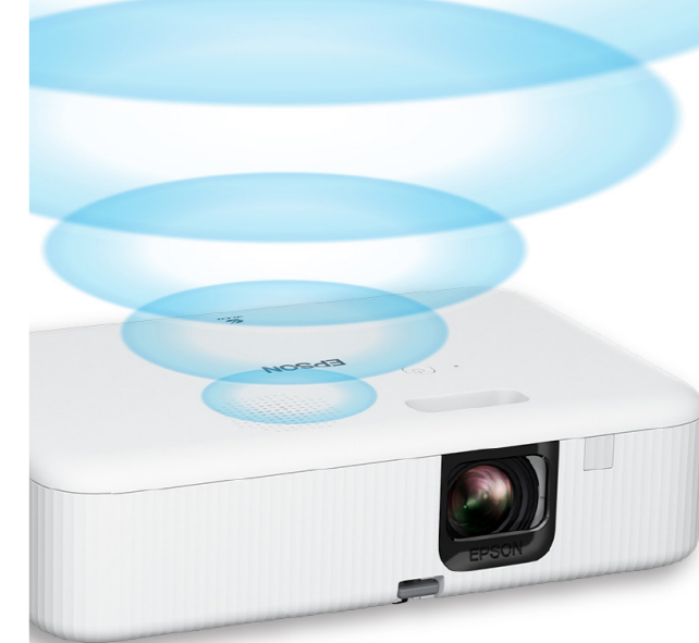
Top speaker placement for optimal sound quality.

The projector also boasts a powerful sound output of 5W and can project wirelessly. Altogether, the CO-FH02 is a well-rounded projector that provides users a multitude of visual experiences with its in-demand features which were designed to meet all of one's lifestyle needs.