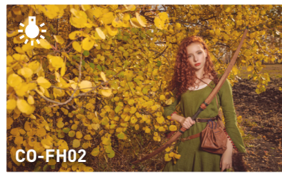
Normal daylight setting

Offering a brightness of 3,000 lumens and a Full HD resolution, the CO-FH02 allows clear and vivid presentations. Complemented by a large and flexible screen size display when projected, users can immerse themselves in the full experience of the CO-FH02.