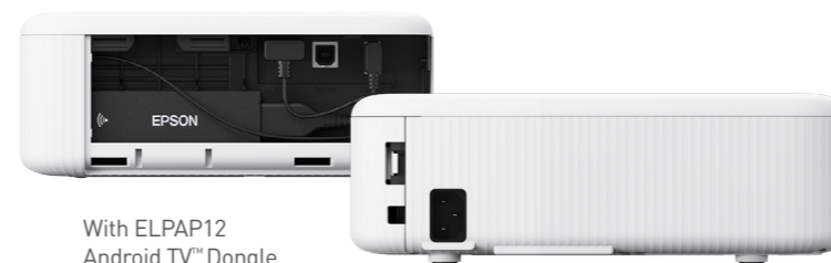
With ELPAP12 Android TV™ Dongle.

The CO-FH02 can function as a smart projector, thanks to its Chromecast built-in™ features and bundled Android TV™ Dongle. Streaming your favourite video content has never been easier!