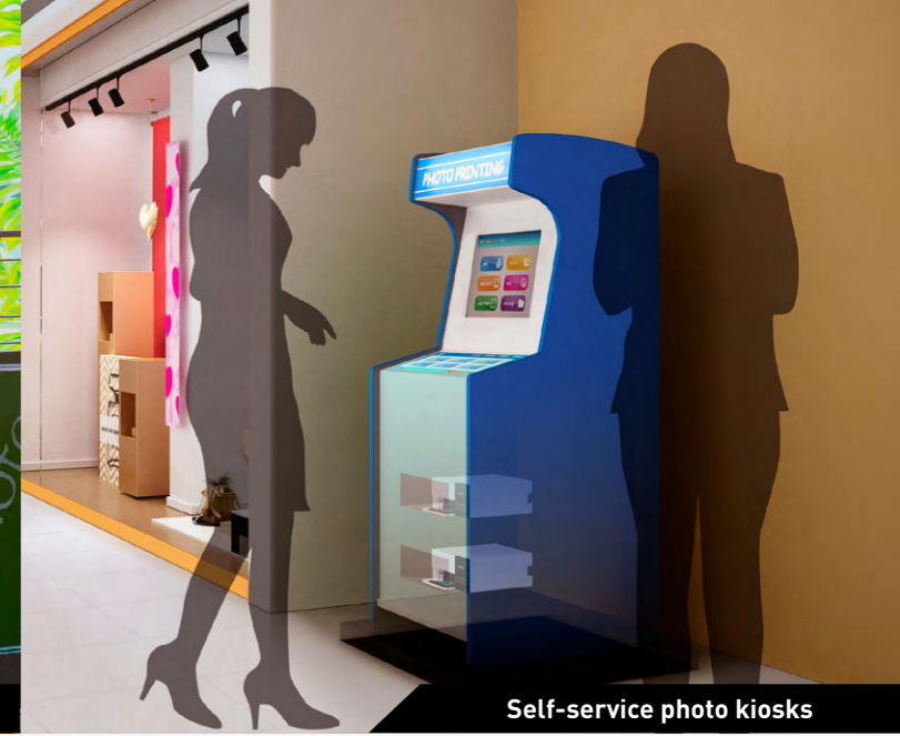
Self-service photo kiosks