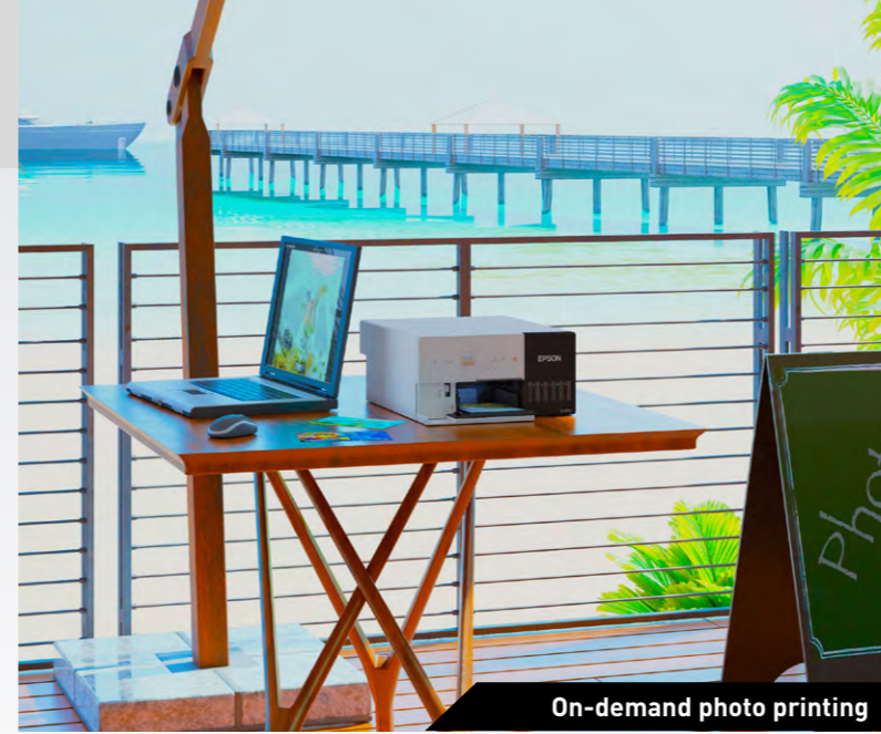
On-demand photo printing