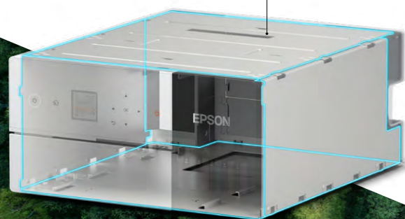
Metal frame design

Epson's SL-D530 is using eco-conscious sustainable materials for resin parts and consumes only 18W of energy during operation. Plus, with enhanced durability, you can expect reliable operation to hundreds of thousands of prints.