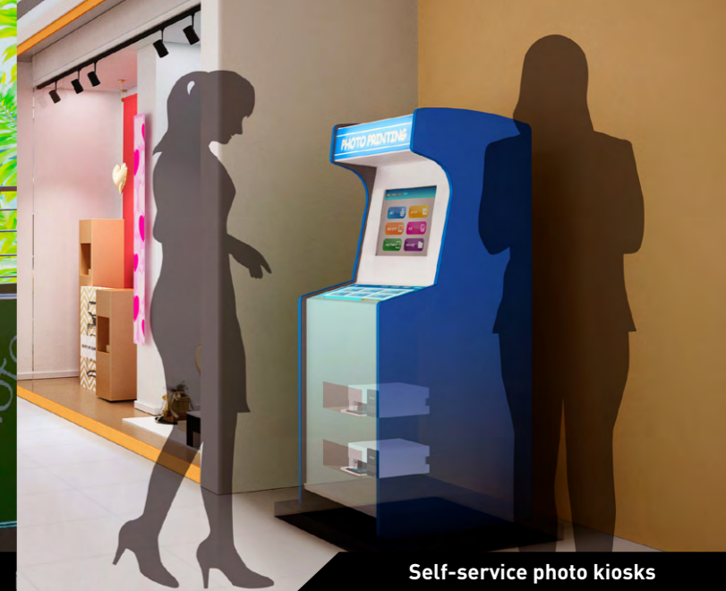
Self-service photo kiosks