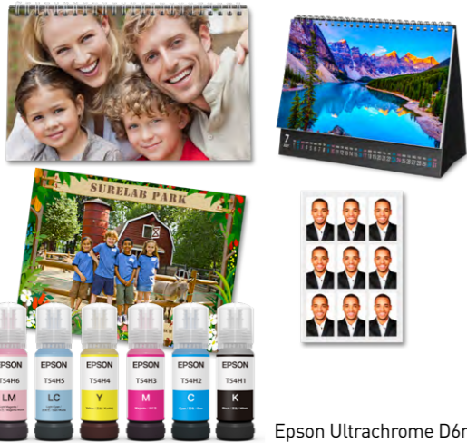
Epson Ultrachrome D6r-S inks

The Epson SL-D530 delivers the incredible colour, text quality and photo results you have come to expect from Epson. Utilising our Micro Piezo Printhead technology, the Minilab printer also uses Ultrachrome D6r-S inks to produce top-notch prints.