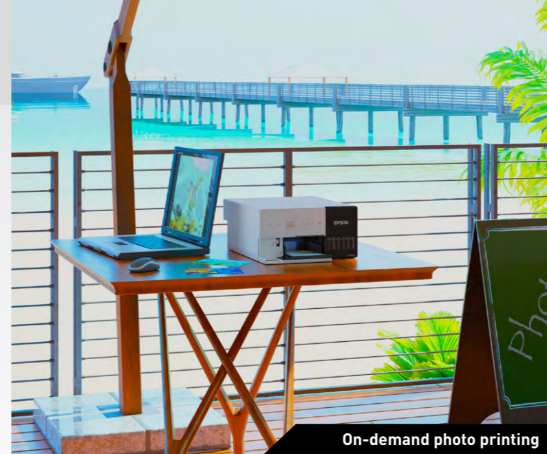
On-demand photo printing