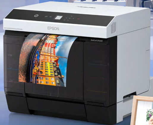
SL-D1030 with Duplex Feeder