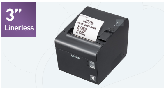
TM-L90-LFC Series 3-inch Linerless Label Compatible Printer