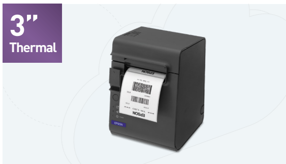
TM-L90/L90 Peeler Series 3-inch Thermal Receipt and Label Printer