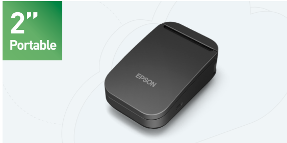
TM-P20II 2-inch Portable Printer