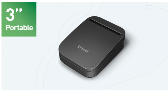
TM-P80II 3-inch Portable Printer