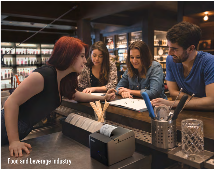
Food and beverage industry