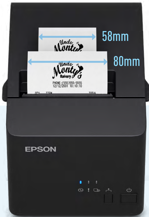
Paper width compatibility depends on selected SKU (58mm or 80mm).