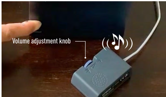
Epson Optional External Buzzer OT-BZ20

The TM-T82X-II is compatible with the optional external buzzer OT-BZ20, offering clear order notification alerts ideal for noisy environments. With this addition, businesses can ensure that orders are easily heard, improving efficiency and minimising the risk of missed notifications.