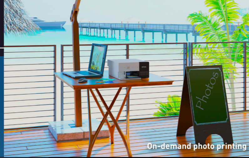
On-demand photo printing

Maximise what your business can offer with the sturdy and compact Epson Surelab SL-D530. Perfect for photo retailers, self-service photo kiosks, self-photo studios, and on-demand photo printing operators that need quick and high-quality on-the-spot photo printing.