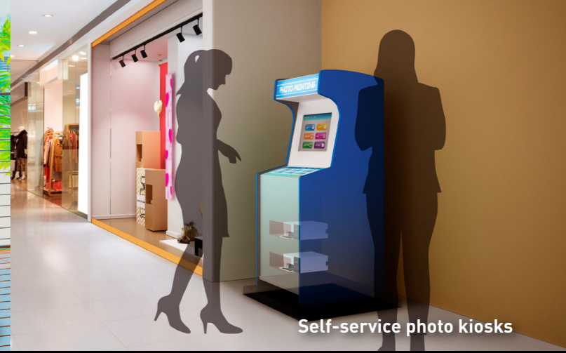
Self-service photo kiosks