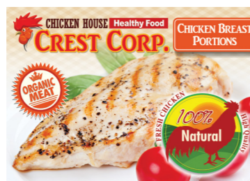
Food and beverage label