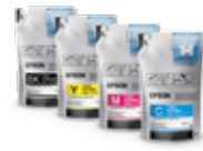
High capacity 1L ink packs.