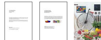
#1 Black Text #2 Black Text and graphics #3 Photo 4R (4 x 6 ")

†1 Print speed (Pages Per Minute) is calculated when printed on A4 plain paper in the fastest mode, 10 x 15 cm photo print speed when printed on Epson Premium Glossy Photo Paper. Print speed may vary depending on system configuration, print mode, document complexity, software, type of paper used and connectivity. Print speed does not include processing time on host computer.