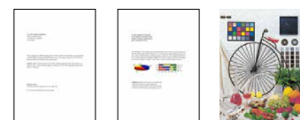
#1 Black Text #2 Black Text and graphics #3 Photo 4R (4 x 6")

#1 Print speed (Pages Per Minute) is calculated when printed on A4 plain paper in the fastest mode, 10 x 15cm photo print speed when printed on Epson Premium Glossy Photo Paper. Print speed may vary depending on system configuration, print mode, document complexity, software, type of paper used and connectivity. Print speed does not include processing time on host computer.