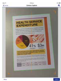
Step 1: Capture & Crop

Print directly from your smart devices or online cloud storage devices. You can also use your smart device as a scanner to capture a document, format, enhance, and print it to a Wi-Fi-enabled printer wirelessly via the app.